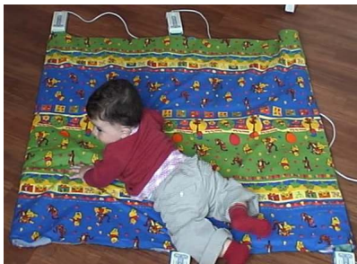
Figure 1. play area (baby mat) equipped with pressure-sensor mat.